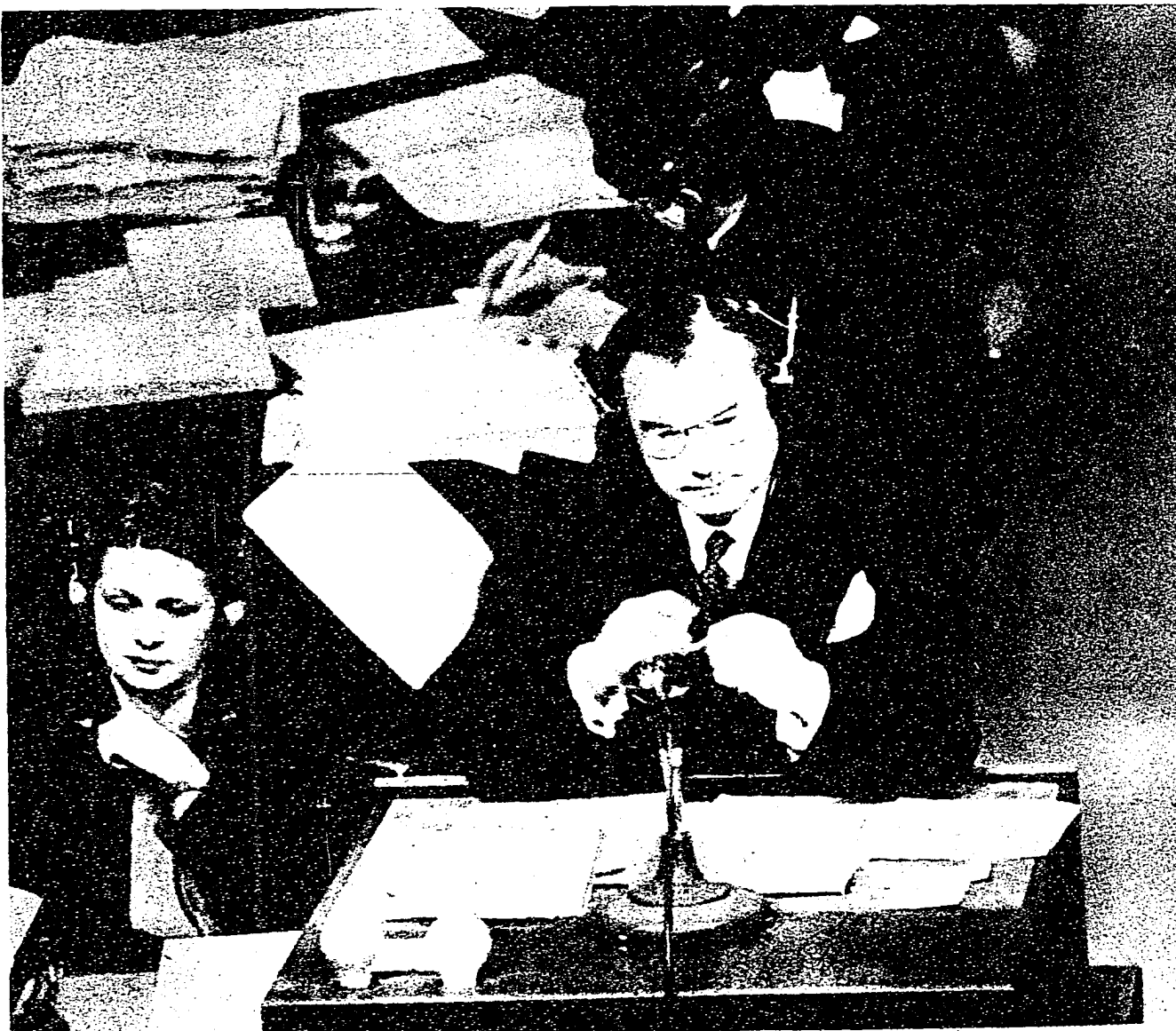
Prosecutor of the Nazi gang—Justice Jackson in the courtroom at Nuremberg.

Counsel have access to their clients and to all witnesses here in Nuremberg. Every document used by the prosecution has been furnished to the defense in German. Every document requested by the defense, if approved by the tribunal as relevant, has been produced by the prosecution if in its possession, (Continued on Page 59)