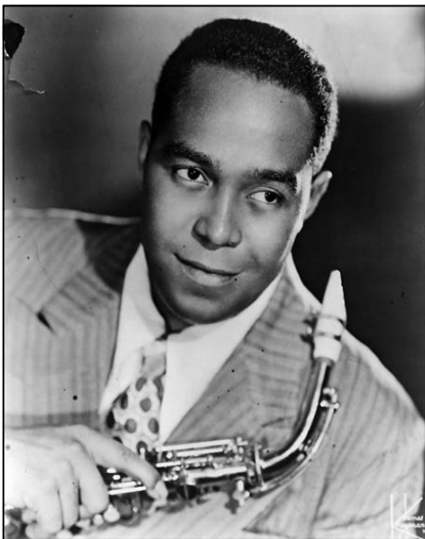
Above: Charlie Parker; Top right: Walt Disney; Bottom right: Tom Pendergast.

Characters such as Walt Disney and Tom Pendergast will be discussed during this workshop and an exciting first person characterization of Jesse James will be featured on Friday evening.